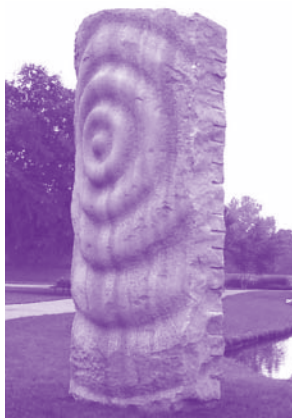
"Rock Waves" by Anno Seiberts, Ettenheim, Germany, at Delco Park

Established in 1999 through the Kettering City Council, CitySites empowers a citizen advisory committee to develop and oversee public art programming in Kettering. CitySites is designed to enhance neighborhoods and the urban environment through the placement and maintenance of permanent public works of art.