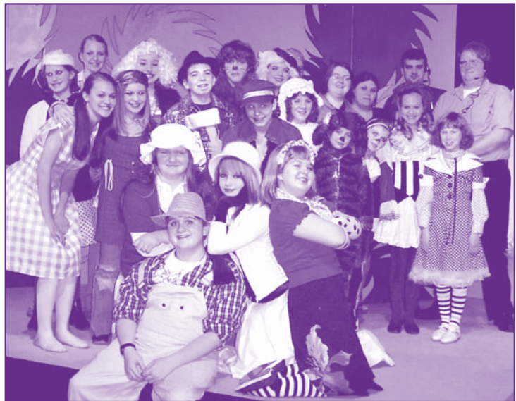
Kettering Children's Theatre, cast of 2009 production of "The Wizard of Oz."